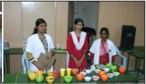
Demo of Natural Diet