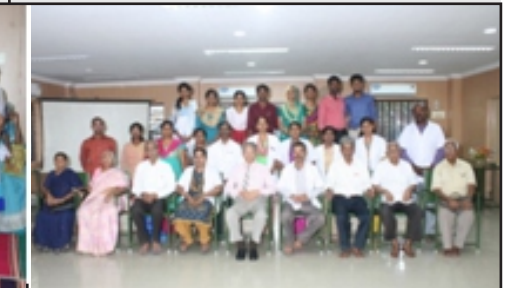
A group picture of Doctors and SCB / EC Members