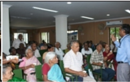
A section of the participants