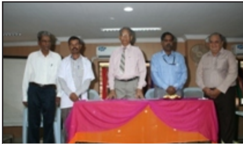
A view of the dias